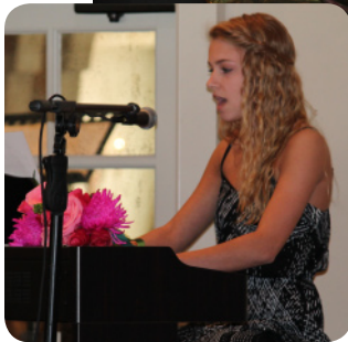
The 2013 Madonna House Tea was held on April 13th at Southern Hills Country Club. Guests enjoyed local entertainers, a candy bar, raffles, tea and more.