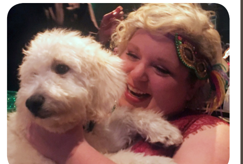
One of the highlights of our live auction: Curlicue the goldendoodle