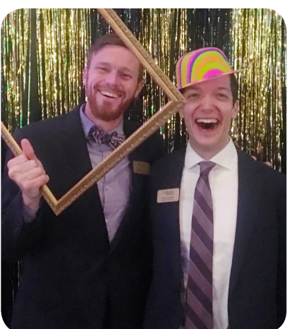
Catholic Charities' Next Gen Committee held a Bourbon Street pre-party for the under 40 crowd