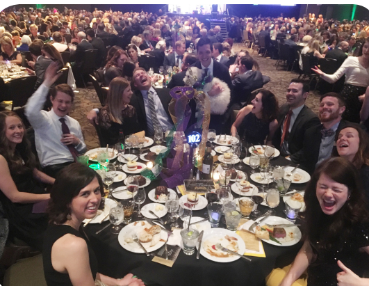
1,100 guests helped make the evening a success