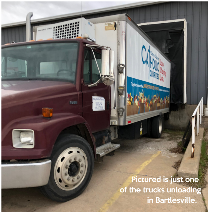
Pictured is just one of the trucks unloading in Bartlesville.

During the weeks leading up to the opening of the main campus warehouse, the presence of CCEOK trucks was a familiar sight along US-75 to Bartlesville, and along US-169 between the Outpost and the main campus.