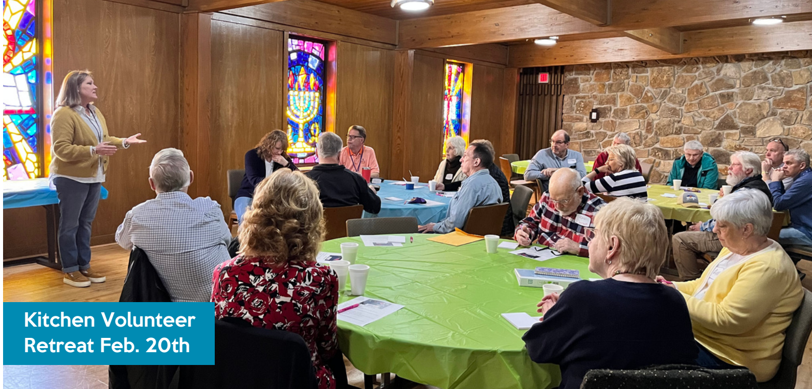
Kitchen Volunteer Retreat Feb. 20th