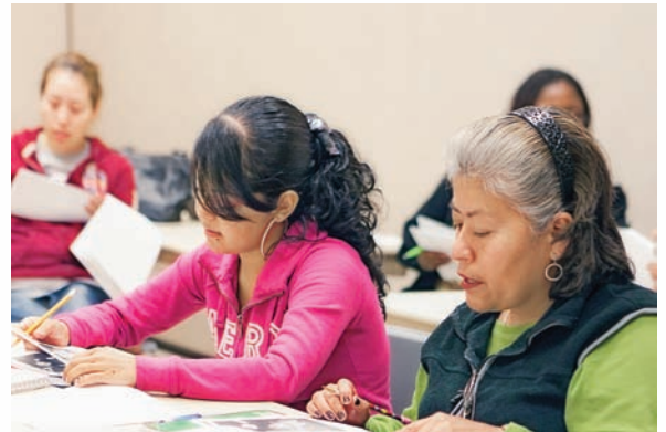
Catholic Charities' Education Center welcomes the YWCA and the Mexican Consulate as new allies

Each year, more than 350 students receive GED, ESL, computer, NFP, job hunting, literacy and parenting classes at Catholic Charities. More than 25 volunteer teachers and staff from organizations including Union Schools, Tulsa Health Department, Tulsa Public Schools, Oral Roberts University and Sodexo work together in the program.