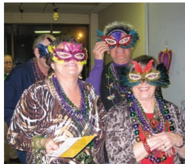
Laissez les bon temps rouler! Volunteers from Catholic Charities' office in Sallisaw were ready to let the good times roll at our Volunteer Appreciation Mardi Gras Bash on Fat Tuesday. More than 150 volunteers and guests attended.