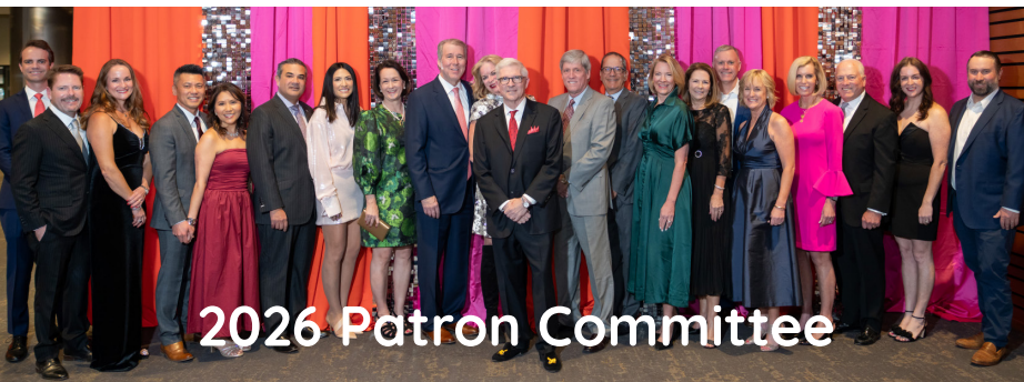
2026 Patron Committee