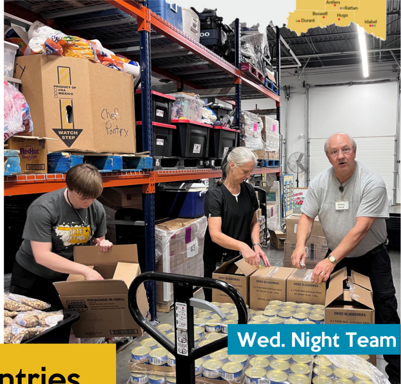
Wed. Night Team