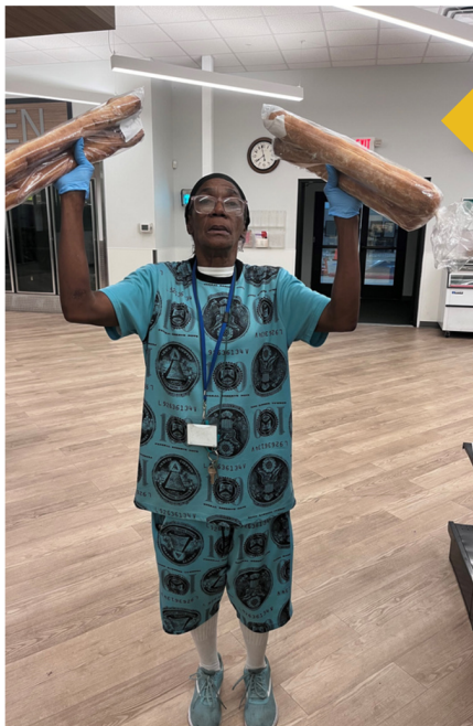
Baguette Press: Determination and pure muscle power help Mitichiziko lift piles of baguettes and other bread items onto the Market shelves, so our clients have plenty of choices.