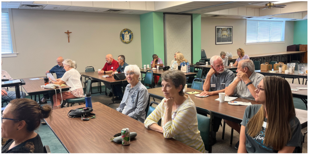
Volunteers from Porta Caeli House gathered recently to train on their volunteer roles and enjoy food and fellowship together.