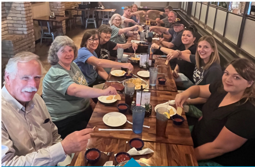
Synchronized Chip Dipping: Well done, Refugee Resettlement Team, who gathered for lunch after acing a double apartment set-up in the scorching heat!

Congratulations to our CCEOK volunteers who win gold every day for their efforts to serve our neighbors in need!