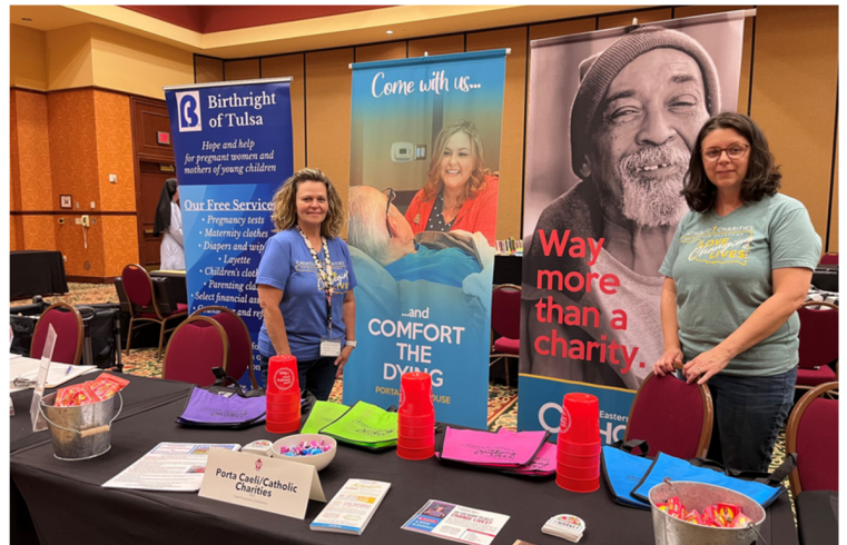
The Catholic Charities Volunteer Office and Workforce Development were at the recent Diocesan Faith Formation Conference sharing the many great volunteer opportunities at Catholic Charities.

Emergency Assistance will be closed for a staff retreat on Friday, September 6. They will be letting clients know so that they are aware ahead of time.