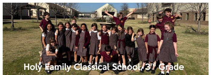
Holy Family Classical School, 3 rd Grade