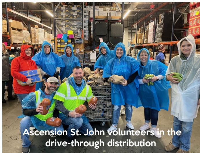
Ascension St. John volunteers in the drive-through distribution