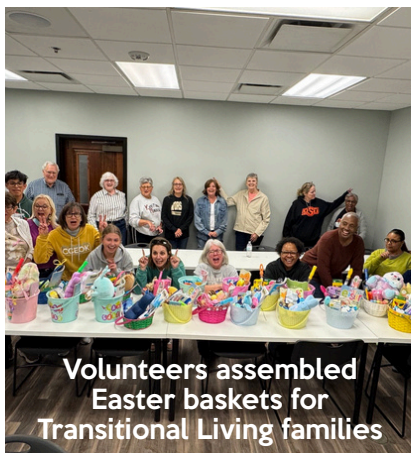
Volunteers assembled Easter baskets for Transitional Living families

March 9-12: Bring your donations to the giant Easter basket in the Tulsa CCEOK front lobby.