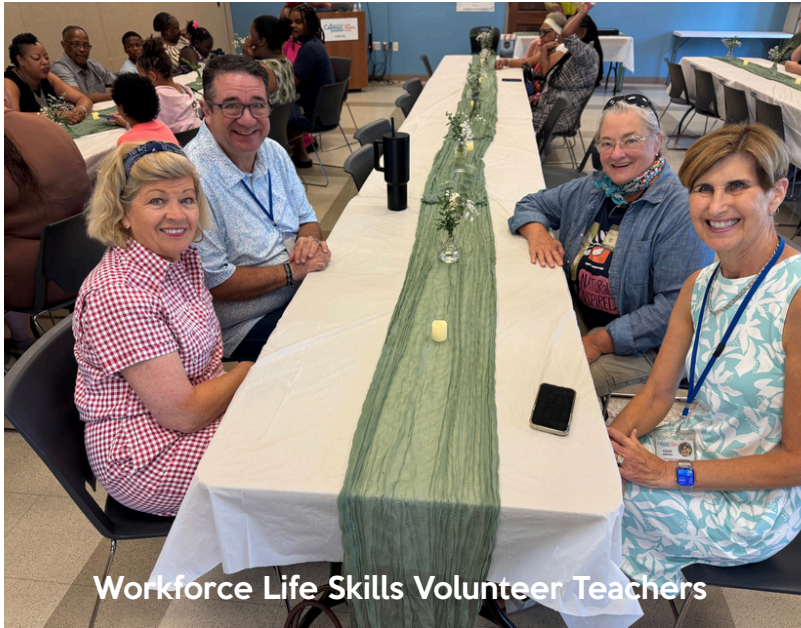
Workforce Life Skills Volunteer Teachers