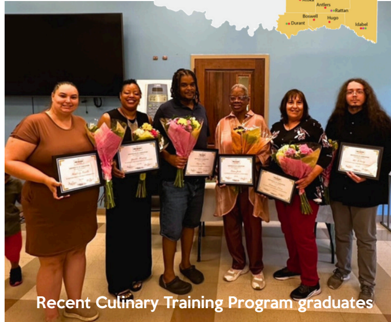
Recent Culinary Training Program graduates