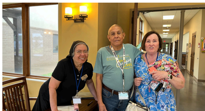
First day of Adult Education: Way to go, volunteer teachers!

Catholic Charities is grateful to NCL families as they strengthen their bond—and their community—with every act of service.