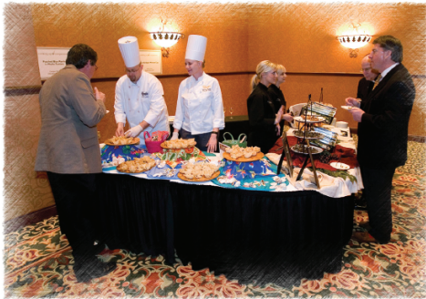
Guests enjoyed appetizers by 19 local chefs

The 2009 Cooking Up Compassion event was sizzling! The night started with fabulous appetizers from chefs all over Tulsa. Guests enjoyed mingling, a fantastic dinner by the Renaissance Hotel, and an exciting auction. With your help we raised $479,000 this year and had more than 680 people attend! Thank you to everyone who helped us make the night wonderful and for those who continue to support Catholic Charities to ensure that those suffering in our midst will get the help and care they deserve.