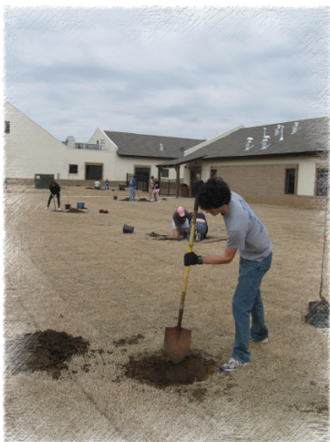
Up With Trees donated 155 trees for our new campus through a grant from the Apache Foundation

Catholic Charities was blessed to have a group who literally "dug in" from the moment they arrived. Digging holes, prepping the soil, carrying trees, replacing sod and mulching the finished product were the actions for the day. Though no one had tree planting experience, they were quick learners and did an outstanding job for us. We thank them for making our campus more beautiful and welcoming to those we serve.