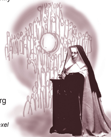
St. Katharine Drexel

Catholic Charities is happy to report that the Saint Katharine Drexel Education Program is in full swing! This new program offers classes five days a week, including evenings and Saturday mornings. Some of the classes include: Intro to Computers, Excel/Word/PowerPoint, GED preparation, resumé writing, interviewing skills, conducting a job search, car seat workshops, Natural Family Planning, English as a Second Language, Smoking Awareness and numerous parenting classes. The Education Program has 18 instructors, most of whom are volunteers. Classes are open to the public. For more information, please contact Taina Wilson, Education Coordinator, at 918.508.7108 or twilson@catholiccharitiestulsa.org